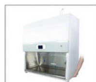
Cabinet Support Block Easy to lift, prevent hand pressing