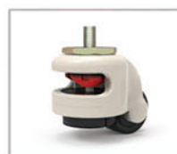
Footmaster Caster Universal caster with brake and leveling feet.