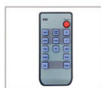
Remote Control All functions can be realized with it, making the operation much easier and more convenient.