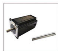
Stepper Motor and Handle The front window can be controlled manually or electrically