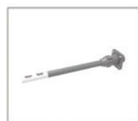
Wind Speed Sensor & EC Fan