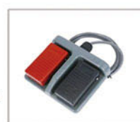
Foot Switch Adjust front window height by foot during experiment, to avoid airflow turbulence caused by arm movement.