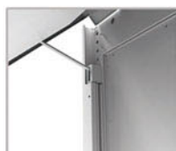
Iron hook support rod for panel support