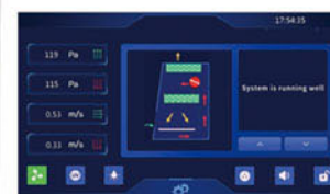
Color Touch Screen Touch operation, real-time and clearer display of various values and appointment timing function.