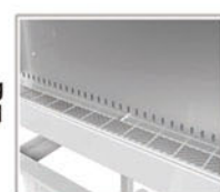
Anti-paper dust structure